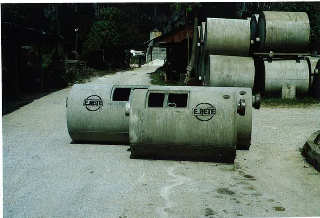
E-RETE R.C. Septic Tank (Round Type)

The Company reserves the right to alter specifications without notice.